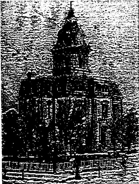
The old Davis County Courthouse

This book was originally published in 1976 by the TTT Society as a bicentennial project. Great effort was made to bring the history of Davis County, Iowa up to date from the last published county history in 1926.