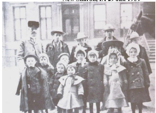
New Sharon, IA 29 Jan 1904