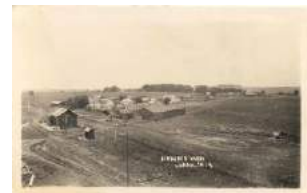
A bird's eye view of Lorah showing the town, railroad and depot.