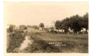
Lorah Main Street looking west in the opposite direction.