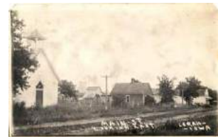
Lorah Main Street looking East.

The only thing left in Lorah is the cemetery, standing by itself, once overrun by cows, and now mostly forgotten.